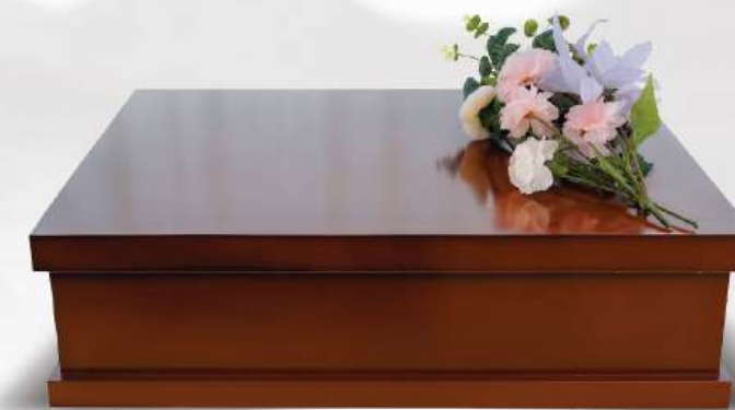
Premium Casket 精致寿木