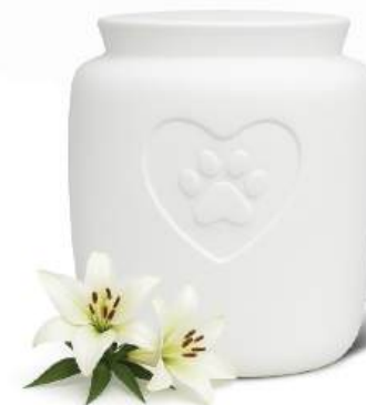
Standard Urn 标准骨灰瓮