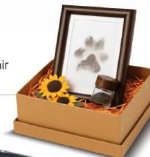
Memorial Souvenir 追思纪念品