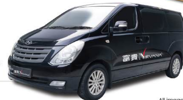
Luxurious Limousine 高级礼车